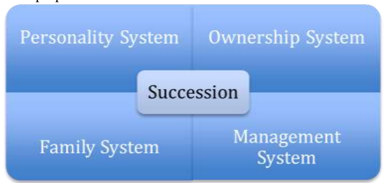
Figure 1. Proportion and Effective Succession

Here is a scheme for proportion and effective succession models: